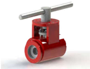
VVT STEAM POWER VALVE Pressure: 150# - 4500#, ASME Size: 5/8" - 2" (& larger upon request)