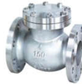
SVT SWING CHECK VALVE Pressure: 2000# - 15000#, API 6A (& higher upon request) Size: 2" - 12" (& larger upon request)