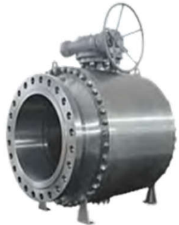
HVT2/HVT3 TRUNNION SOFT SEAT BALL API 6D 150# - 1500#, ASME 2" - 36" (& larger upon request)