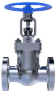
HWWGT WEDGE GATE VALVE Pressure: 150# - 600#, ASME Size: 1/2" - 36" (& larger upon request)