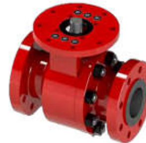
CVT FLOATING BALL VALVE Pressure: 150# - 2500#, ASME Size: 2" - 24" (& special order)