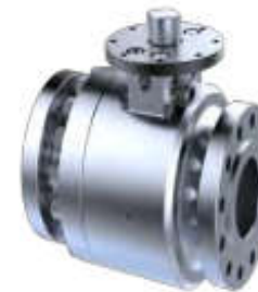
PVT PIG VALVE Pressure: 150# - 1500#, ASME Size: 2" - 12" (& large upon request)